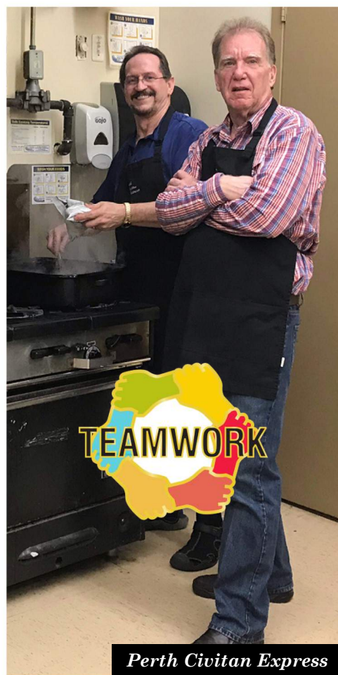
Perth Civitan Express